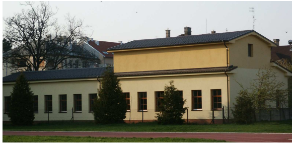
View of the lab